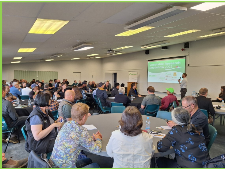
Above: Vegetables NZ Roadshow in action.

Molly recently attended the Vegetables NZ Roadshow in Pukekohe where around 100 attendees gathered for updates from key industry bodies including PotatoesNZ , VegesNZ , TomatoesNZ , OnionsNZ , and VICE . All of the speakers delivered excellent insights, however, Molly found the presentation delivered by Farzana Adams , CEO of the Fresh Produce