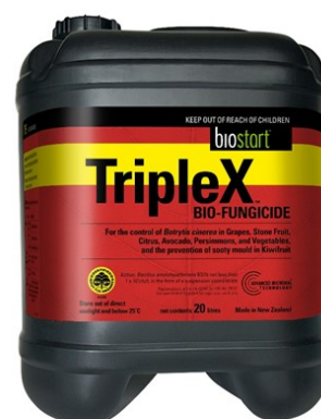
New TripleX Drum Certified Organic