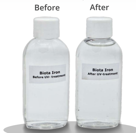
UV-Treatment has no effect on Biota Iron