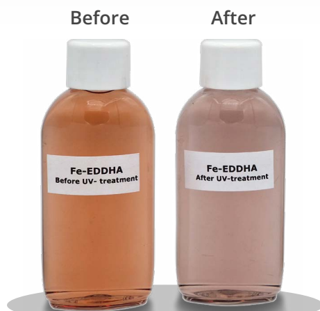
UV-Treatment affects Iron in Fe-EDDHA

EASY NUTRIENT UPTAKE AND PREVENTS IRON CHLOROSIS